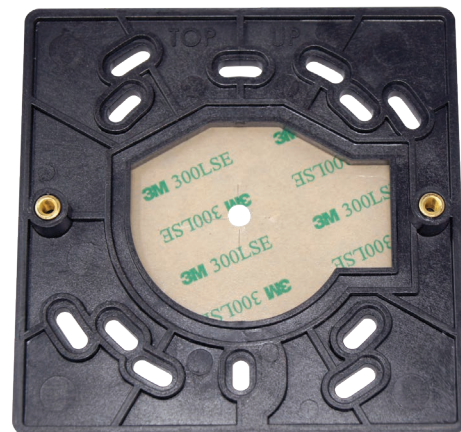
8138 Mounting Bracket With Gasket