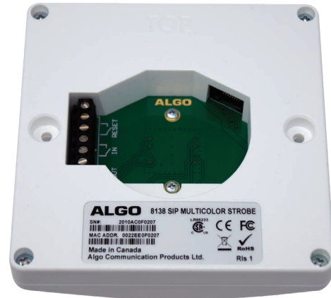
8138 Bottom View