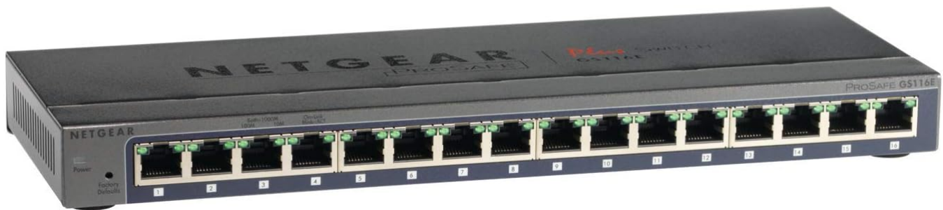
Netgear 16-Port Switch

Sometimes additional Ethernet ports are needed. Use one of the following switches after your router to connect additional devices inside your LAN: