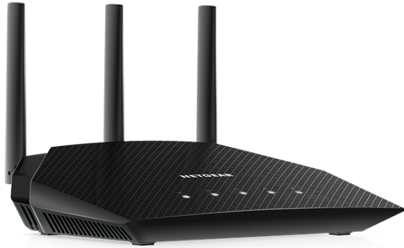
Netgear AX1800 - $150/ea - Mid-Range WiFi-6 router for 2 story homes up to 1,500 sqft.